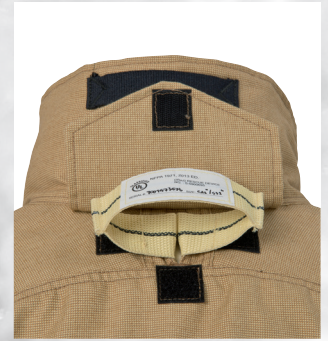
DRD integrated in neck area