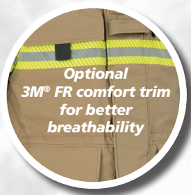
Optional 3M® FR comfort trim for better breathability