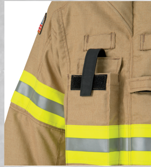
Convertible radio pocket with mic strap