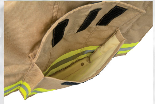
Cargo pockets with twill lining of Para Aramid and drain holes