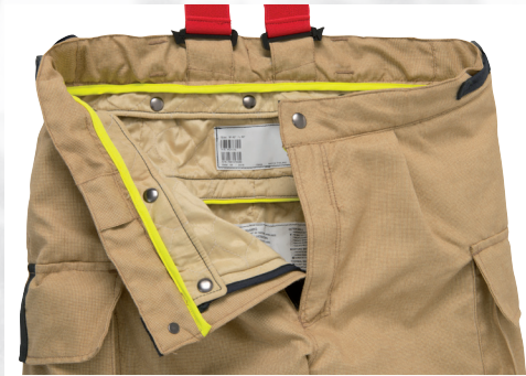
Detachable liner with inspection system and adjustable waist