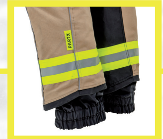
Pant cuffs with special closures