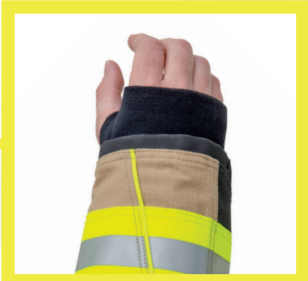
Firmly closed cuffs