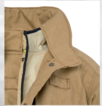
Detachable liner with inspection system