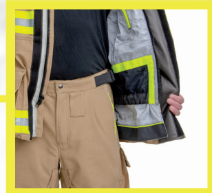
Extra protection at the waist - standard when choosing PartX™ cuffs