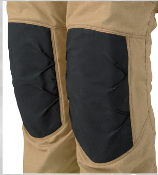
Ergonomic knees with inside knee pockets for extra pads