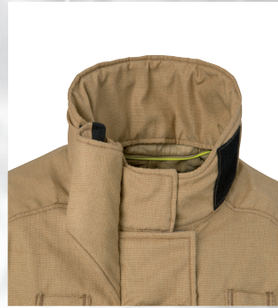
Zipper extends to collar